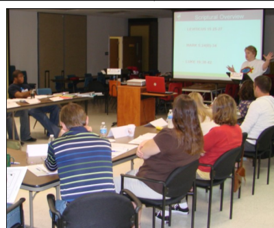
Waco Methodist Children's Home

Church (Disciples of Christ) congregations participating.